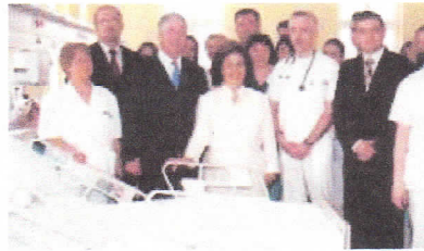
Dozens of critical care beds, birthing beds and other items were donated to the Lifeline Humanitarian Organization and shipped to war-torn Serbia. Pictured, Her Royal Highness Crown Princess Katherine of Serbia visits a hospital where donated beds are used in the Intensive Care Unit.