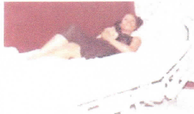
A patient rests in a donated hospital bed at the Presbyterian Health Centre in Cameroon, West Africa.