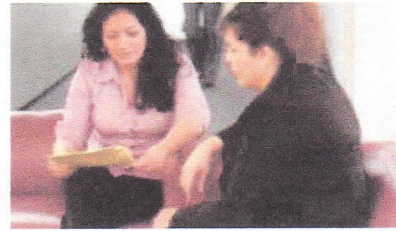
Donated furniture is put to use in the waiting area at Erie-West Town Health Center on the city's Near West Side.